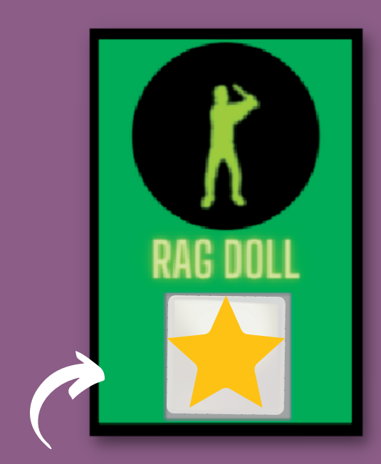
REWARD STICKERS MARK THE MOVES YOU HAVE LEARNT EACH TERM!